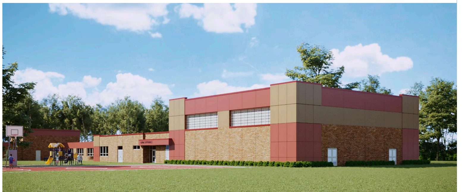
Above, architects rendering of Sherrard Elementary with the 15,000 square foot addition. Construction is set to begin in June.