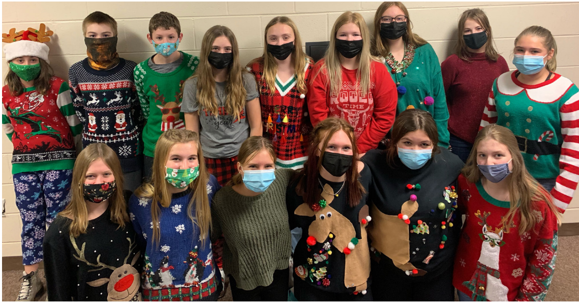
Ugly sweaters bring cheer for junior high students. They had fun getting in the spirit during holiday dress up week.