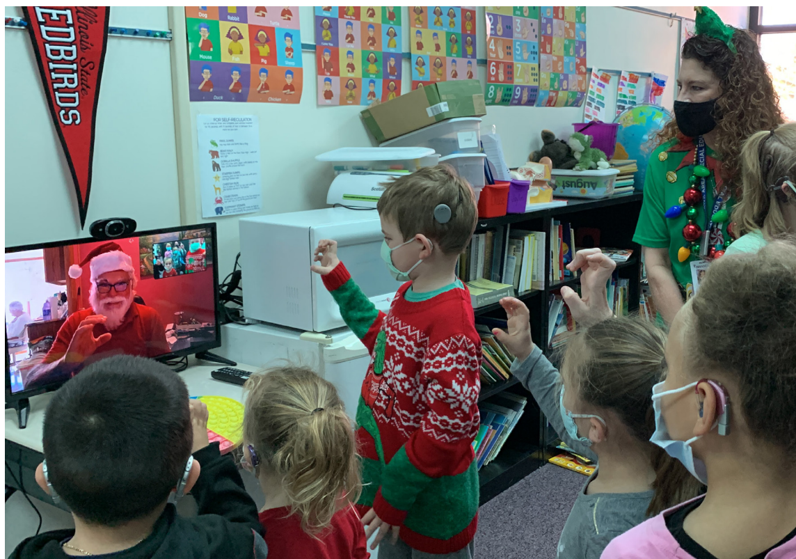
Pictured above, Santa Claus signs with Deaf/Hard of hearing students at Winola Elementary. They told him what they wanted for Christmas and asked questions about his frosty operation in the North Pole.